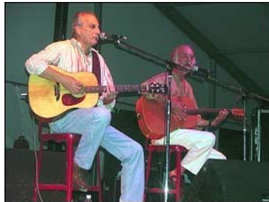
Tom Shipley (left) and Michael Brewer, Americans

We enjoyed some good story-telling between songs. The crowd favorite was the one about The Happy Warrior, a lounge in Rochester, Minnesota. That's where the duo first presented, honed, and lengthened Jim Pepper's "Wichi Tai To" (to become one of their most popular songs) over a two-week stint at The Warrior because it was the only song, according to Shipley, they "could sing that they didn't hate us for. The work guys came after work to hang out and drink way too much beer, and they took one look at us, and they hated us." So they just kept on playing what they call "the happiest song we know" over and over and somehow survived. With about a fourth of our audience from Rochester (and apparently regulars at The Happy Warrior), the tale was very well received. Tom said, "Don't tell me it's still there. Please tell me its lamp is dark by now!"